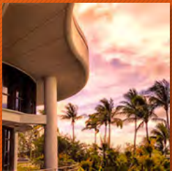
Marine & Atmospheric Science