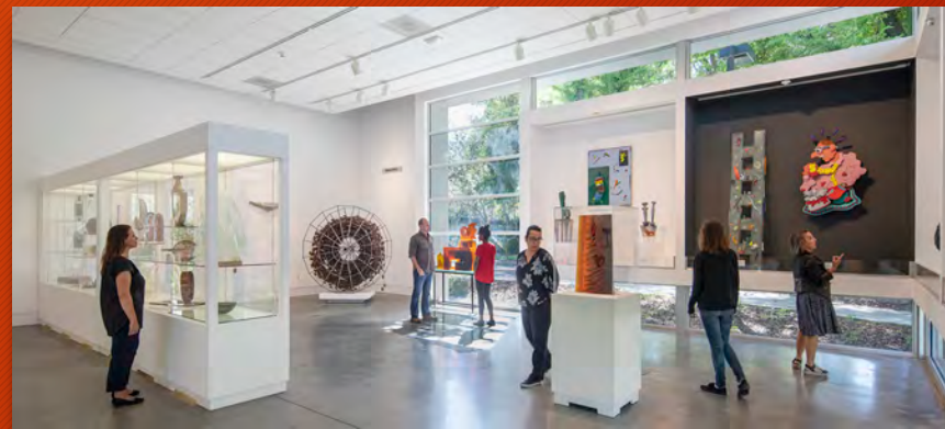
Lowe Art Museum lowe.miami.edu

Digital Collections online: digitalcollections.library.miami.edu