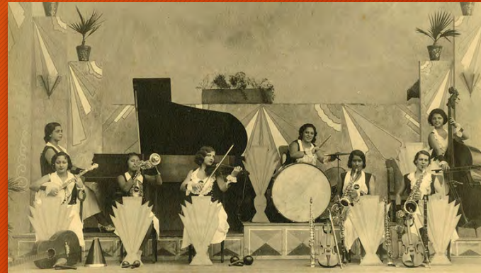
Cuban Heritage Collection library.miami.edu/chc