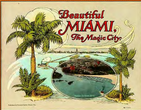
Special Collections (Kislak Center) library.miami.edu/ specialcollections