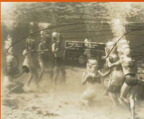
University Archives library.miami.edu/ universityarchives