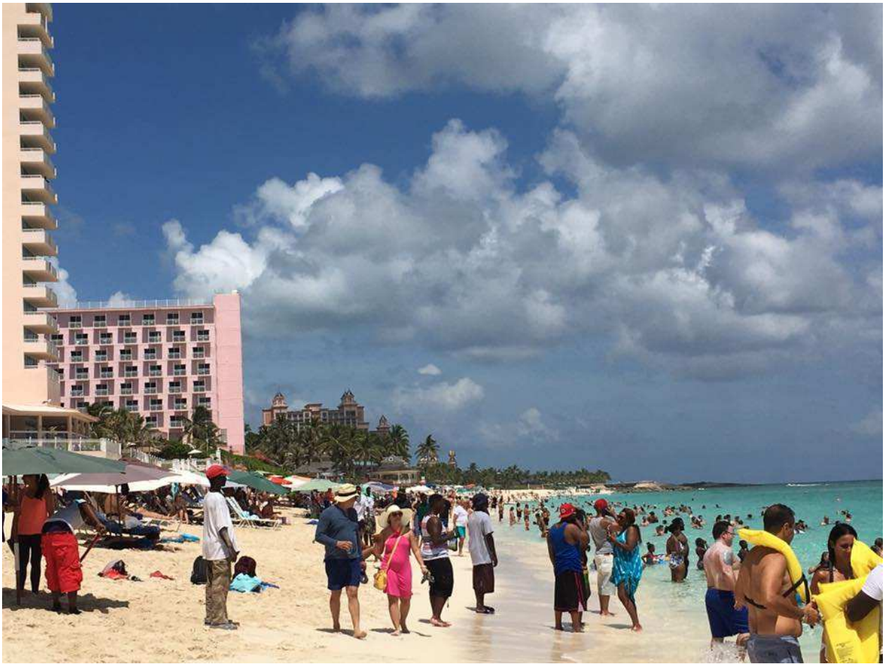
(Beach at Atlantis, Paradise Island, Nassau, Bahamas)